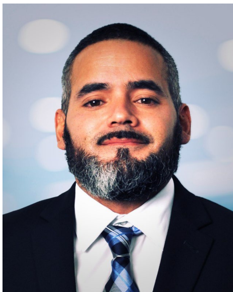
Enterprise Asset Management Team, StandardAero